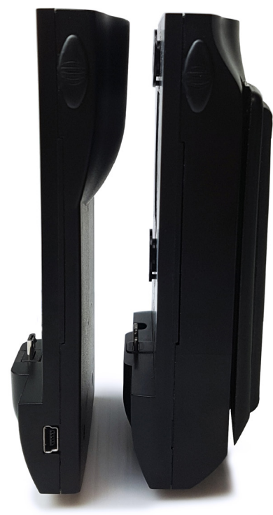
Grabba S-Series SLIM